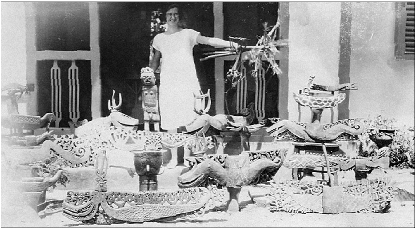
Fig. 6. Indigenous ritual objects at a Protestant missionary post on Alor, Netherlands East Indies, 1930. Items such as that held by the missionary's wife were burned; the rest, mostly representations of the mythical serpent naga, were collected for an ethnological museum in the Netherlands. However, naga are known to have been burned on a considerable scale on this island on other occasions.

early 1960s, where Lutheran evangelists had talked villagers into throwing away their sacred timbu and tapa stones, believed to be spiritually powerful and dangerous. The evangelists smeared these stones with excrement to degrade them, and explained the fact that the missionaries themselves survived this action as a sign of their own greater spiritual force (Strathern 1981).