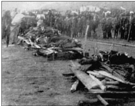
Fig. 2-5. Headdresses, amulets, weapons and other indigenous objects being burned in the presence of an American fundamentalist evangelist, Ilaga Valley, western New Guinea, spring 1960. From Anonymous 1960.