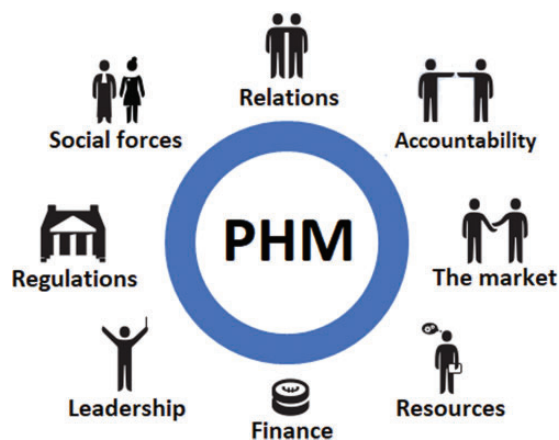
Figure 1. Collaborative adaptive health network (CAHN) components for successful PHM development. PHM: population health management.

Accountability refers to who (which parties) can be held accountable or hold others accountable, the domains and processes of accountability including formal and informal procedures, for instance, for adherence to PHM goals and specific performance thresholds. The management of competing accountabilities was seen to be particularly challenging because of the many stakeholders involved who operated in different sectors and different contexts