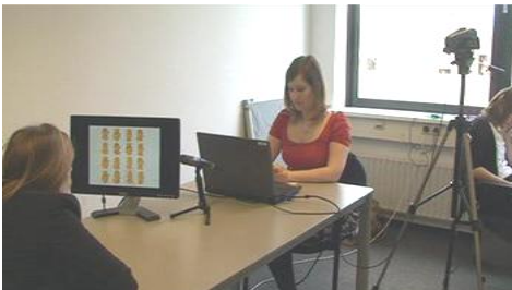
Figure 2: Example of experimental setup. The director is seen from the back, viewing one of the picture grids.

The experiment consisted of a director-matcher task that was performed in a lab, where the director and the matcher were seated at a table opposite each other (see figure 2 for an example of the setup). The director was presented with the trials on a computer screen, and the task was to provide a description of the target object in such a way that it could be distinguished, by the matcher, from the 15 distractor objects. The director was told that the matcher was shown the same objects on her screen as on the director's screen, but that these objects were ordered differently for the director and the matcher (this meant that the director could not use the object's location in the grid for the target descriptions).