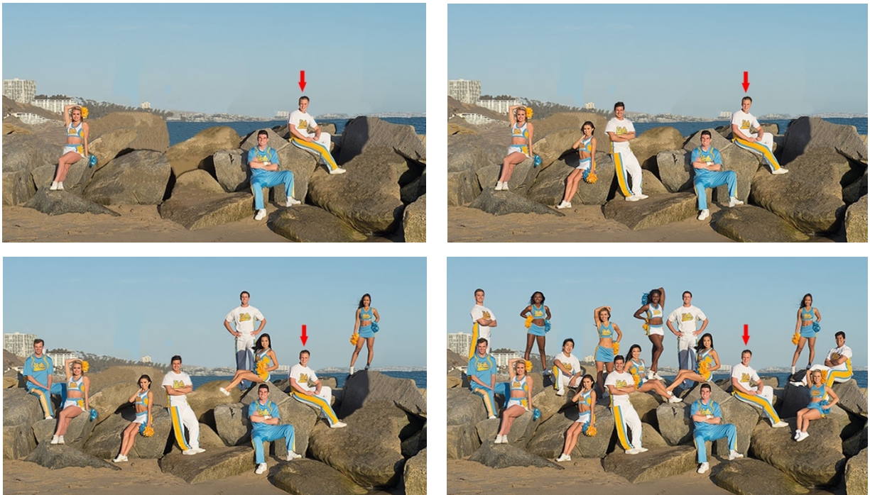
Figure 2: Examples of critical trials in the color condition, representing the four levels of Domain size: two distractors (upper left), four distractors (upper right), eight distractors (lower left), and sixteen distractors (lower right).

Every participant saw a subset of the total number of critical trial pictures that was available. Four subsets of were created, representing four lists of critical trials (both in color and black and white). Essentially, every list consisted of six repeated items for all four levels of domain size, which makes 24 critical trials for the whole experiment. We made sure that every list contained every basic scenario three times, but always with different domain sizes, and different target persons. For example, for the basic scenario in Figure 2, the first list con-