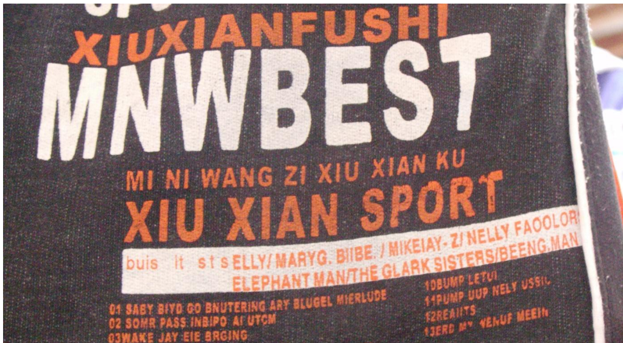
Figure 1: Lookalike English (Lijiang, China, August 2011).

accurate parsing, we now know that natural languages can have a great deal more functions, many of which appear to bear little denotational weight.