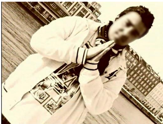
Figure 4: Still picture from YouTube video ‘Just a rapper’

In what the adolescents call their more ‘serious’ rap the style is very different. Similarly to the ‘Wannabe’ video, the visual side of this production consist of shifting still pictures. The boys’ expressions on these pictures are, however, different. They appear in light colours and as we see in figure 4 and deploy hand postures associated with Buddhist greetings in contrast to the West Coast hand sign in figure 3.