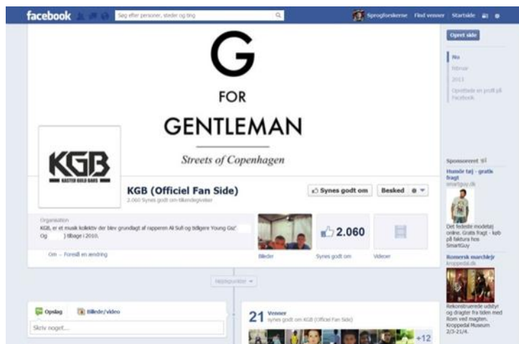
Figure 2: The KGB Facebook page

It was characteristic of both rap associations that they drew heavily on the infrastructures provided by digital social media. Both Ghetto Gourmet and KGB, for instance, had Facebook pages and presentation videos on YouTube, and another initiative by Sufi was a dedicated digital rap channel, RapMoves TV , and a digital production company.