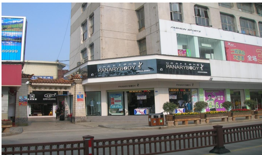
Figure 2: Panarybody

This can count as English in Lijiang, a small tourist town in the Soutwestern province of Yunnan, China. China, as we know, is significantly more central in the world of business and finance than in the world of English; and Lijiang is definitely the periphery of China. English is a very rare commodity in such places, hard to acquire and hard to develop and use as a medium of communication. Yet, people know the emblematic value of English, and this kind of lookalike English is widely used and displayed. In a classic sociolinguistic fashion, such displays are not random. We find them whenever items or places need to be flagged as posh, expensive, better-than-normal, new, international and aimed at the affluent and the young. Thus, a shop where old-fashioned farmers' and workmen's clothes are sold – Mao-style jackets, simple cotton shirts, slacks and caps – shows no inscriptions in English at all; but around the corner, a rather more upmarket boutique targeting fashionable young customers calls itself “Panarybody” (see Figure 2).