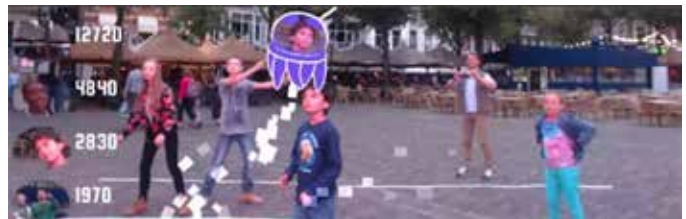
Figure 8: Slow 27