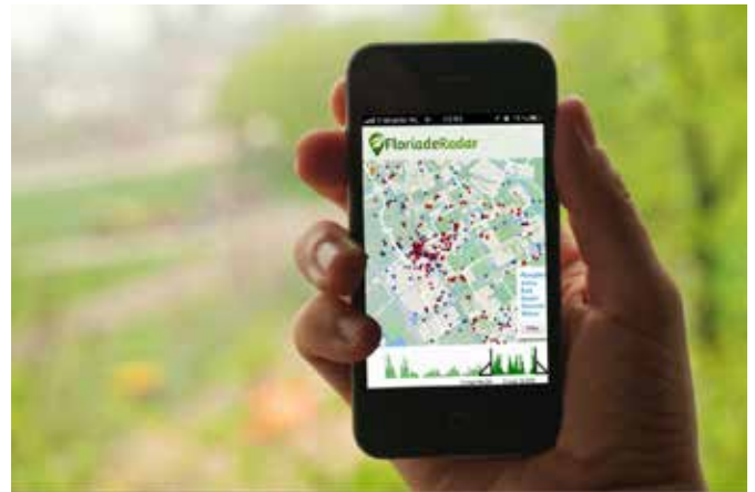
Figure 3: What FloriadeRadar would have looked like if fully developed 13

as a feedback system for municipal policy developers. The development of the app was funded by local government as part of a larger bid to attract a large event to a particular district of the city. In this case, the developers did not win and the app was never implemented. 12