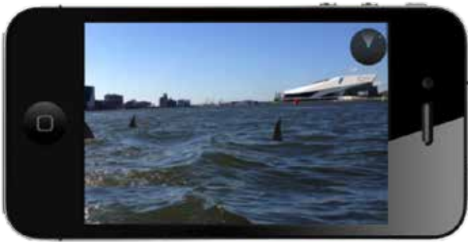
Figure 2: Augmented reality project on sharks in 'het IJ' visible through the smart phone as part of Zo niet, dan toch . 8

a specific location where participants would receive part of a dialogue, with someone else at the same location receiving the other part. In order to act out the entire dialogue, people had to find each other and work collaboratively.