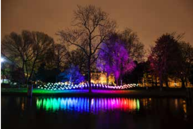
Figure 4: An installation as part of the Amsterdam light festival 15

Intervening in public space through light has become a major part of current public art projects in Amsterdam. The most important project is the Amsterdam Light Festival, subsidised by the Amsterdam Art Fund and private partners. This event hosts a large number of light sculptures in Amsterdam—particularly around the canals—to include boat tours as another vantage point from which to view the works. Fieldwork was conducted around the organisation and presentation of this festival. Firstly we found a respondent—a Russian architect who works throughout Europe on various projects—who was presenting work as part of the festival. He considered his contribution to the Amsterdam Light Festival to be an experiment: a detour from architecture into the world of art. He devised a plan to construct a dome made of discarded bicycle wheels, a reference to the city's preferred means of transport.