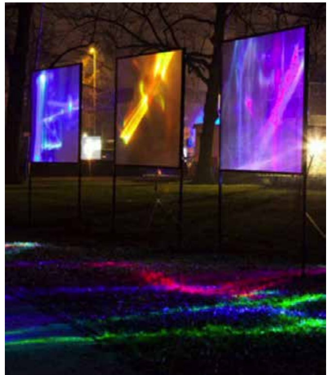
Figure 5: installation by Joris Strijbos included in Parklicht 16

I find it a dubious development to be honest: in a few years people will be clapping and whistling in front of a Mondrian and will walk away disappointed if the squares do not change in color. That is no joke: I have seen it happen with a poetic and modest light artwork by Jan van Munster that someone said: 'It doesn't work!' (Organiser Staatslicht)