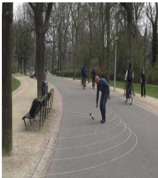
Figure 9: Sand Mapping in Amsterdam 30

Sand Mapping is a work by the Amsterdam-based artist duo PolakVanBekum. 29 The two make sand drawings in public spaces and photograph them in order to share the effects on their website and social media platforms. The artists claim that sand drawings, however subtle, immediately change the atmosphere of a certain place. They also encourage people to use their templates or invent their own patterns in order to have an increasing number of people making and sharing sand drawings around the world.